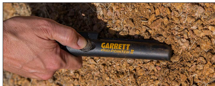
(Above) Use a quick power off/power on process to tune out mineralized ground, salt, and other challenging environments.