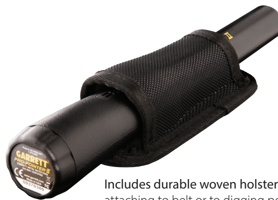
Includes durable woven holster for attaching to belt or to digging pouch.

The Garrett Pro-Pointer II is manufactured in the United States of America and in accordance with Garrett's ISO 9001 internationally certified Quality Management System.