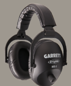
MS-3 Z-Lynk Wireless headphones PN: 1627710